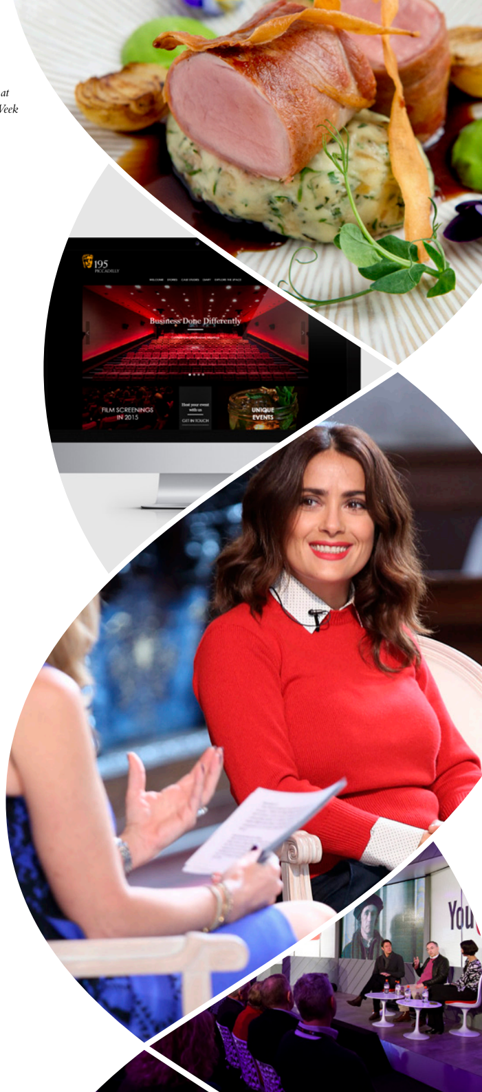
From top: An example of BAFTA 195 Piccadilly's sumptuous menu; the relaunched BAFTA 195 Piccadilly website; actress Selma Hayek speaks at Advertising Week Europe; a YouTube event at Ad Week

In the autumn of 2014, we launched our first dedicated BAFTA 195 Piccadilly newsletter for our members, covering upcoming events, offers and activities. The aim is to engage more directly with our members and to provide a 'club'-like feel to our offering. Around the same time, we also launched our new-look website . It is regularly updated with events and offers, giving members and clients more opportunity to engage with past, present and future activities taking place in the building. With the help of BAFTA Productions, an independent production duo were commissioned to create bespoke content for the website. See for yourself by visiting the site here .